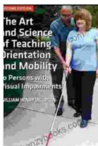
Image alt: Book cover of "The Art and Science of Teaching Orientation and Mobility to Persons with Visual Impairments" featuring a group of people walking with canes and guide dogs.